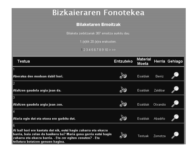
Figure 3: Result list

Figure 3 shows the look of the result list.