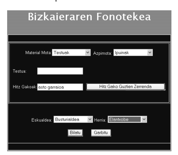
Figure 2: Standard search form.

For a search performed with the standard form, every result must accomplish all of the search conditions.